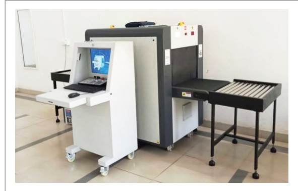
X-RAY BAGGAGE SCANNER