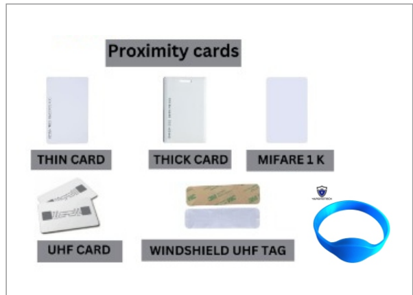
UHF TAG/ WRIST BAND /RFID CARDS