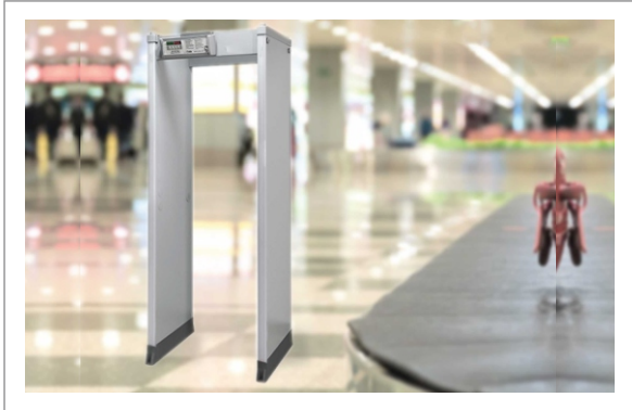
DOOR FRAME METAL DETECTOR