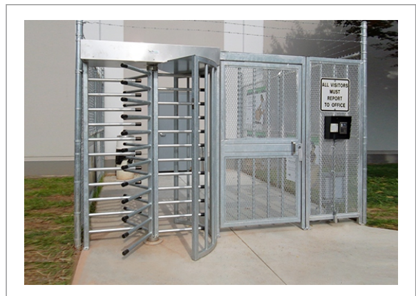
FULL HEIGHT TRUNSTILE