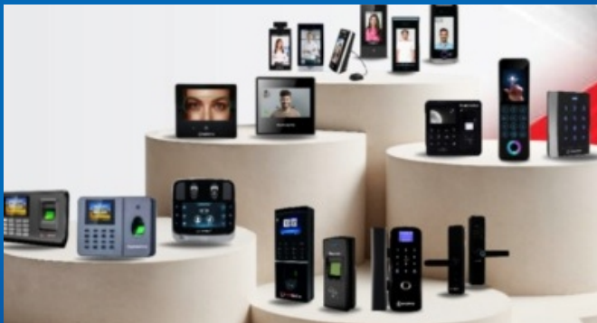
Fingerprint & Face Reader Machine with Access Control