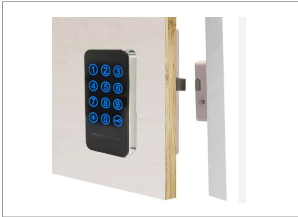
CABINET LOCKS / LOCKERS LOCK