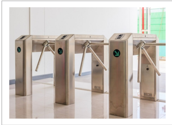
TRIPOD / TURNSTILE