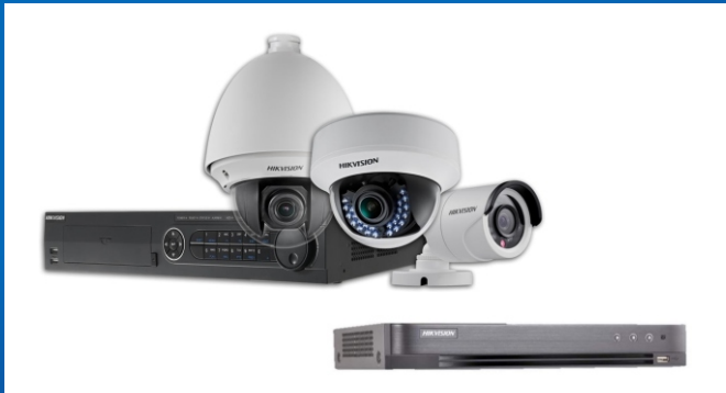
CCTV - IP & HD/DVR/NVR/ PTZ Camera