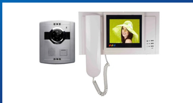
Video/Audio Door Phone with Electrical Locks